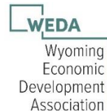
Wyoming Economic Development Association