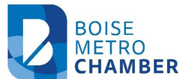
Boise Metro Chamber