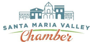
Santa Maria Valley Chamber