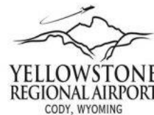
Yellowstone Regional Airport