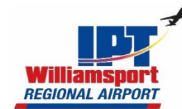
Williamsport Regional Airport